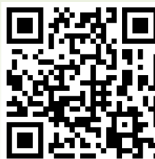
Quick Response (QR) Code

For those of you who didn't see the recent article in the June issue of the Pensacola-based Independent Weekly newspaper, the Destination Archaeology! Resource Center is offering its visitors something different. Let's start with the strange image below. This is a QR code, and those of you with a smartphone handy can actually scan it. What happens when you do this? In this case it will send you directly to FPAN's website. These are popping up in many museums across the country. This technology offers several other possibilities that museums can now take advantage of and we are jumping onboard.