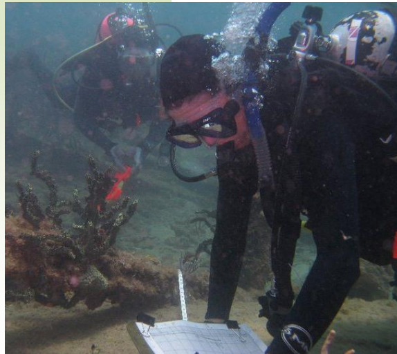
Inaugural SSEAS class practicing recording skills in pool and on SS Copenhagen, a Florida Underwater Archaeological Preserve