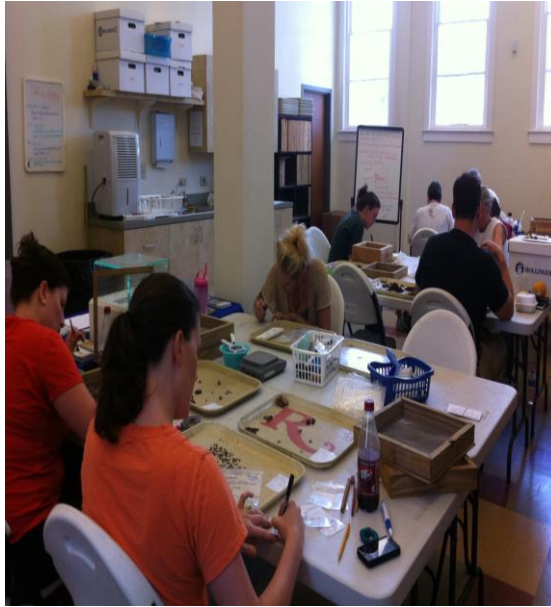
Volunteers in the FPAN Lab

Looking for something new to do this fall? Come experience history and volunteer in the FPAN archaeology lab!